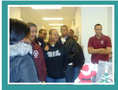
Bison visits the Armed Forces Retirement Home