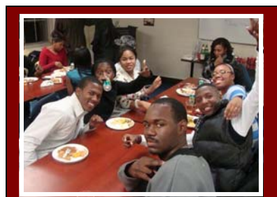
2008 Bison Thanksgiving Potluck Dinner