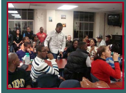
Bisons partake in the Thanksgiving Potluck

More Bison in action Photos in our album at http://www.coas.howard.edu/departments/#army