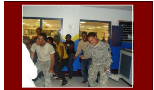
2008 Mentor and Mentee night