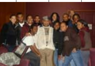
TOP: Cadets take a break during a visit to the AFRH