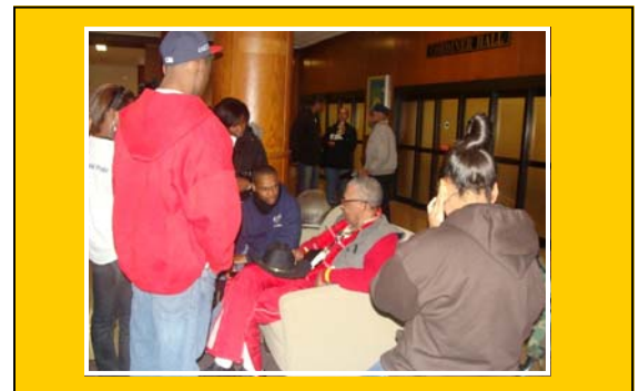
Decades apart in age, a resident tells the story as the Bisons listen